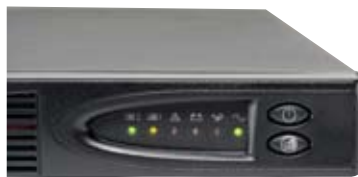
5115 RM front panel